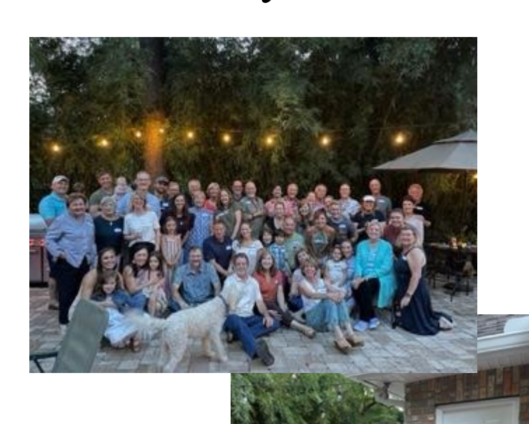
Spring Neighborhood Party